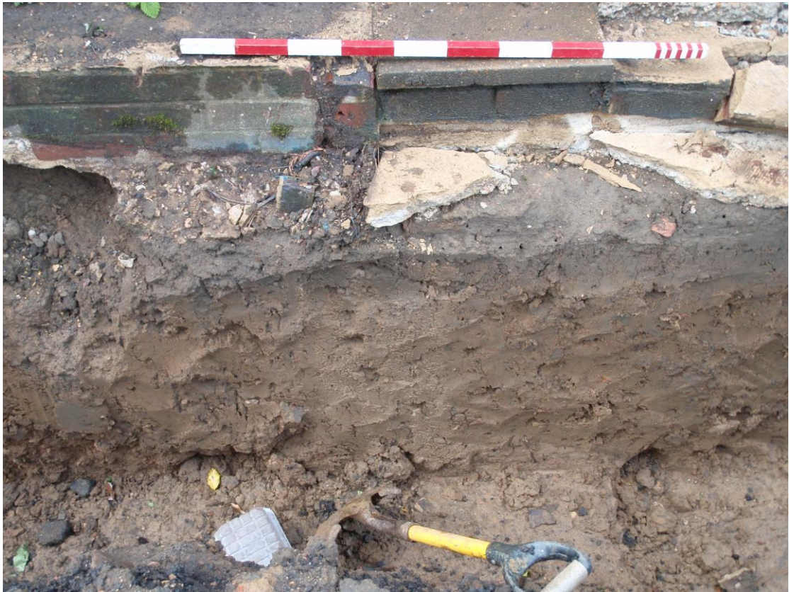
Plate 3. Detail of the natural geology of the site – Clay, Silt, Sand and Gravel