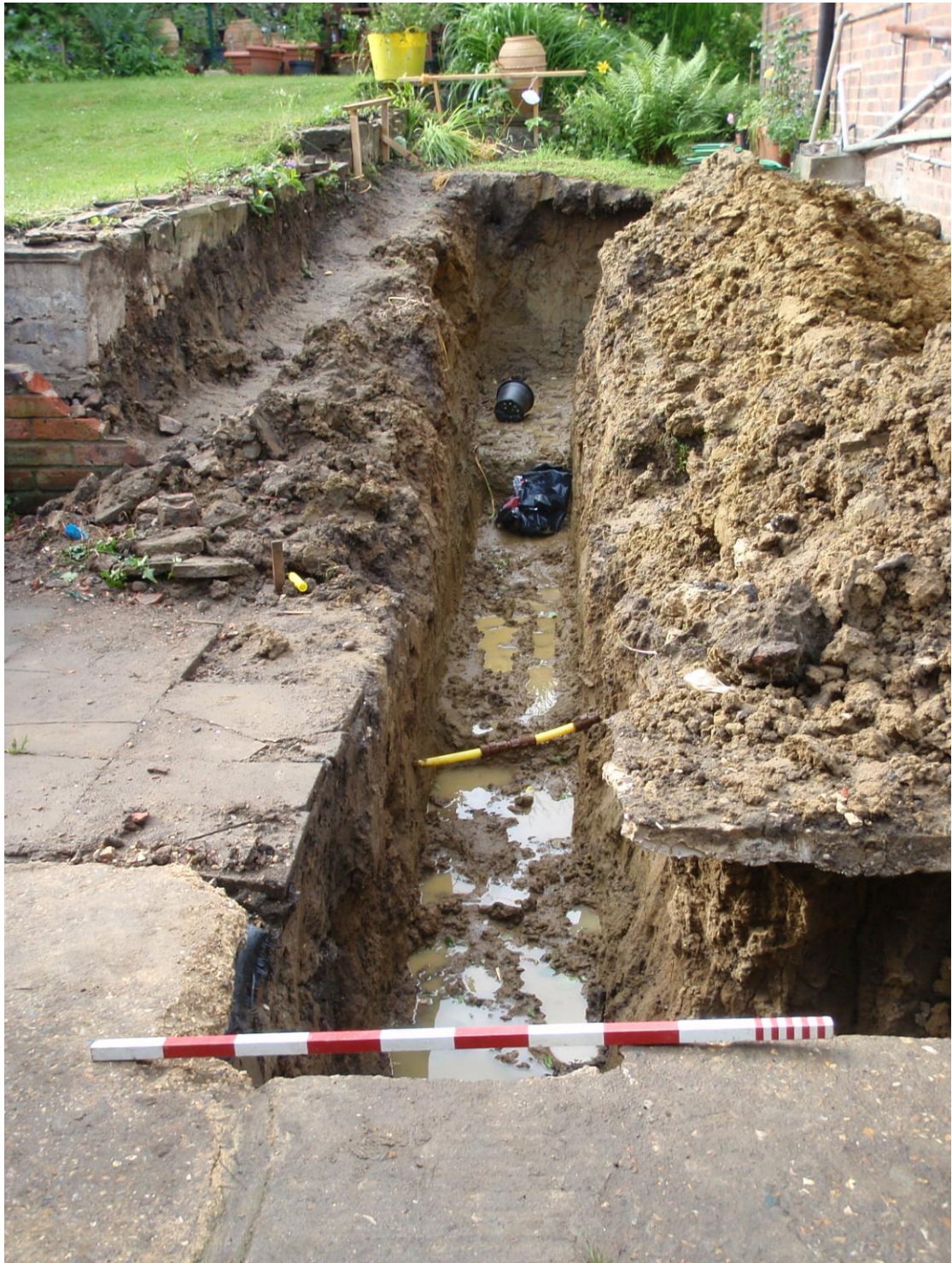
Plate 1. Showing foundation trenches (facing south-east)