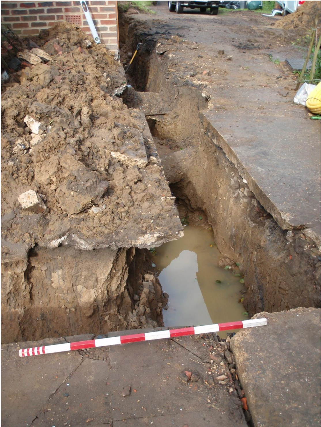
Plate 2. Foundation trenches along the frontage of the building (facing south-west)